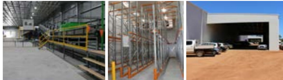
Moora Citrus Packing Shed & Covered Loading Facility – 6225m 2

Value Bracket | $1000 - 1250K Manufacture | 6 weeks Site Time | 6 weeks