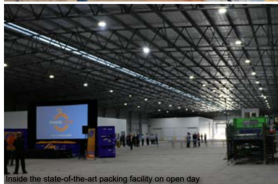
Inside the state-of-the-art packing facility on open day