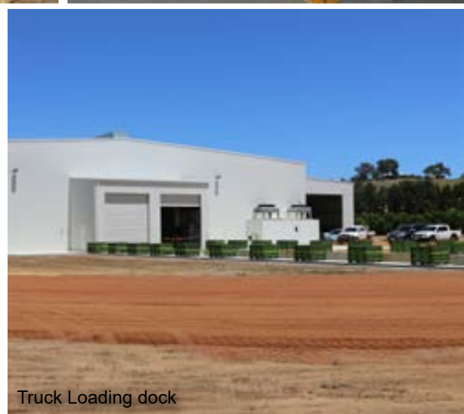
Truck Loading dock

CALL TODAY FOR YOUR DESIGN & QUOTE 1300 271 220