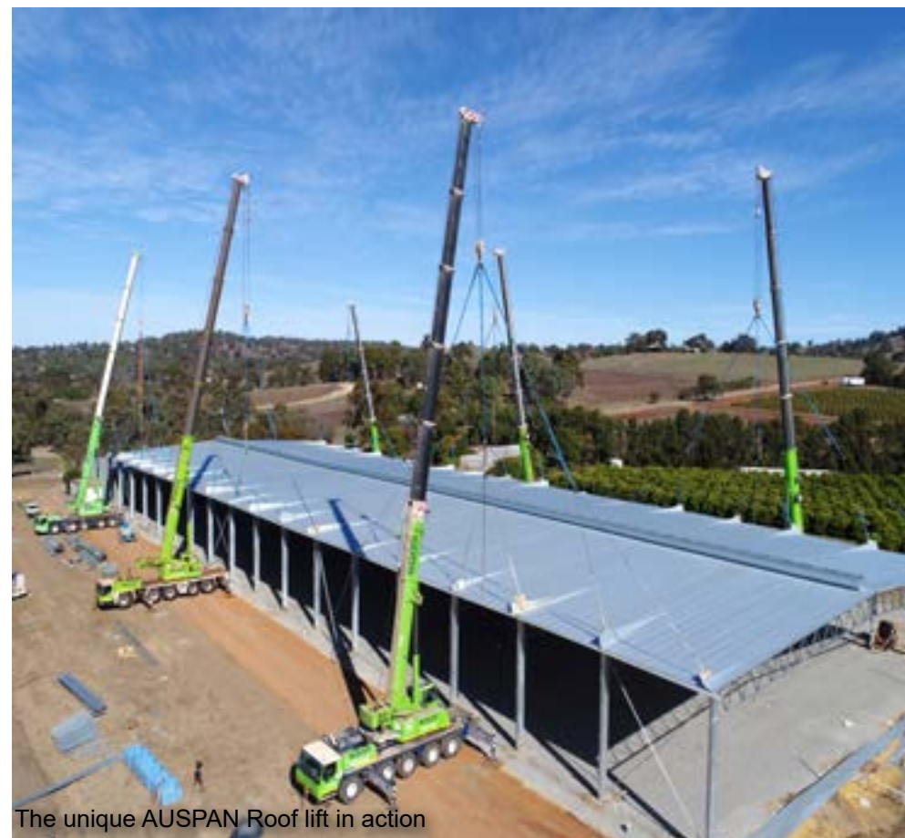
The unique AUSPAN Roof lift in action

WA's LEADER IN THE DESIGN & CONSTRUCTION OF STEEL FRAME SHEDS AND BUILDINGS