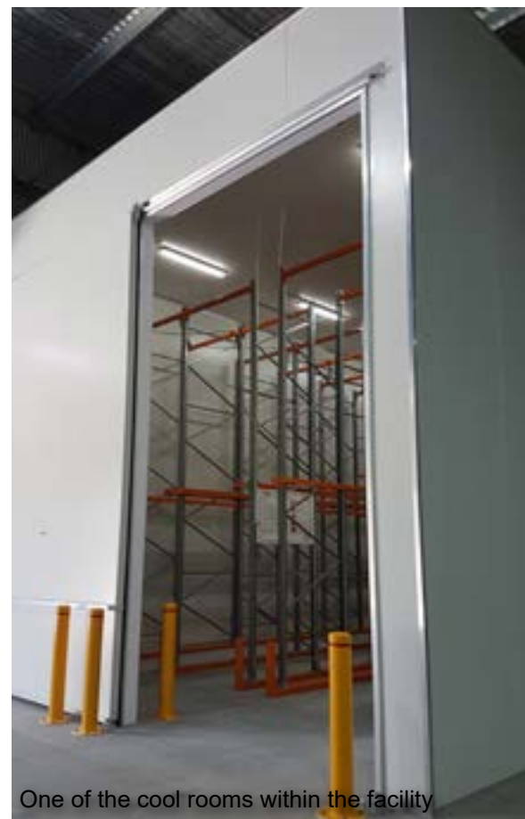
One of the cool rooms within the facility