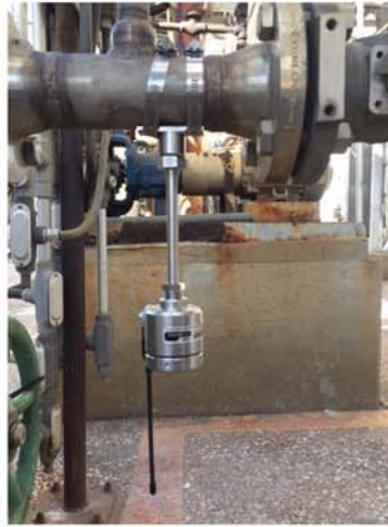
High-temp dual-element unit installed using bands.