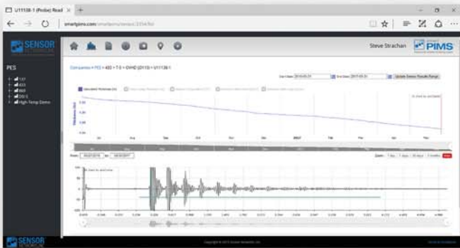
webPIMS™ cloud-based data portal offers all available information including corrosion rate and temperature-corrected thickness data.