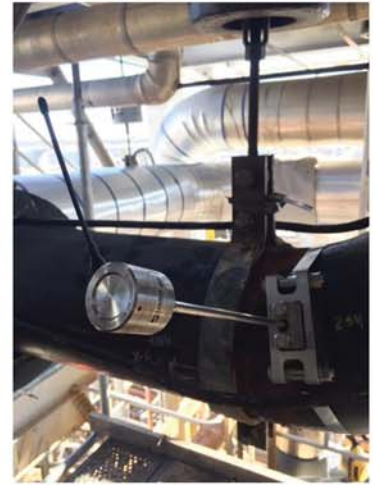
Ultra-high-temp unit installed using pipe clamp.