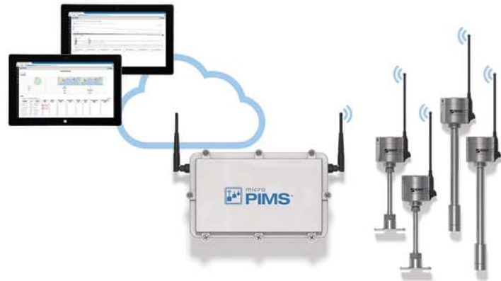
microPIMS® complete kit—including sensors, gateway and software—is only available with a subscription-based cellular/cloud solution.