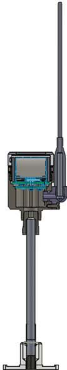
Cross-sectional view of high-temp dual-element microPIMS® sensor.