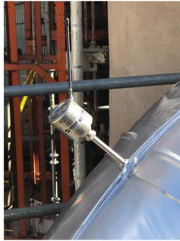
High-temp dual-element unit installed under insulation.