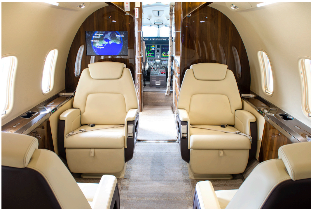
Interior looking forward