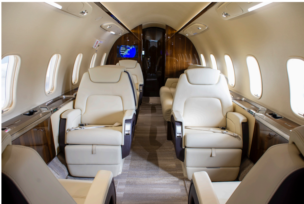
Interior looking aft