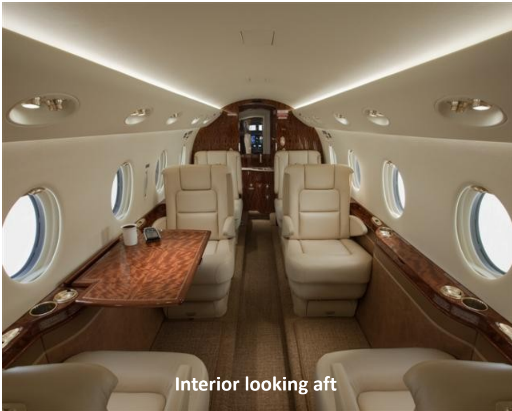
Interior looking aft