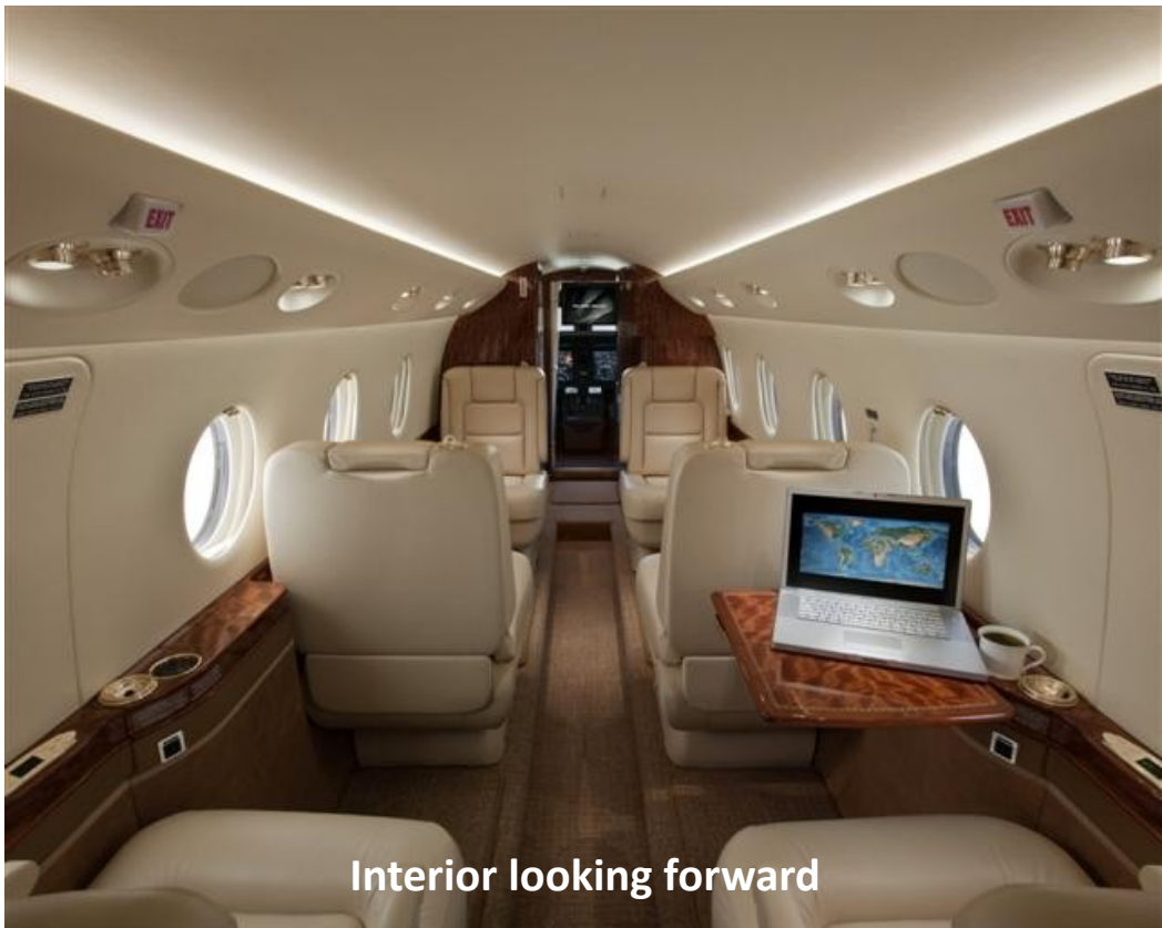
Interior looking forward