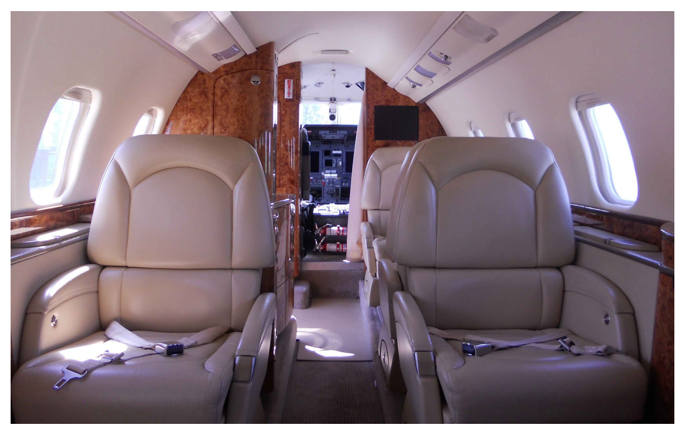
10/26/2018 Specifications subject to verification upon inspection. Aircraft offered subject to prior sale or removal from market.