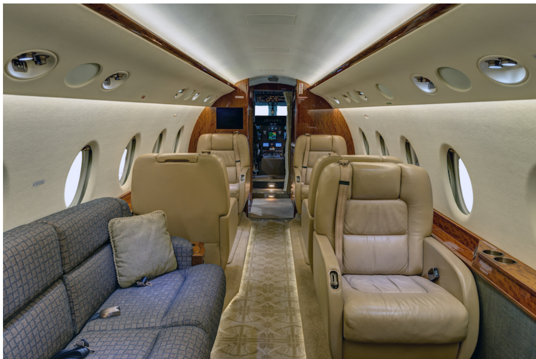
Interior looking forward

Specifications subject to verification upon Buyer's inspection. Aircraft offered subject to prior sale or removal from market.