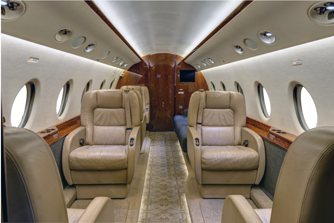
Interior looking aft