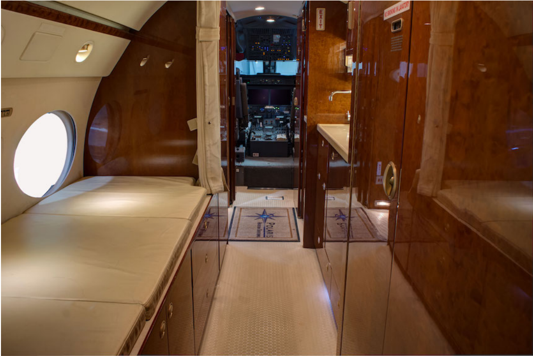
Forward Crew Rest Area