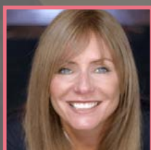
SENATOR FRANCES BLACK Founder, RISE Foundation