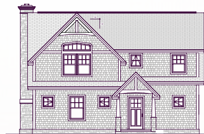
3 ENTRY SIDE SCALE 1/4" = 1'-0"