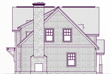
2 LIVING ROOM END SCALE 1/4" = 1'-0"