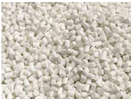
PICTURED: Close-up of PX2 Grade

PX2 Grade is available in: • 44 lb. bags (pictured above)