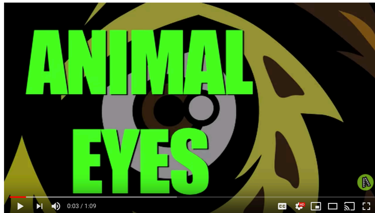
Sight - Imagine What Animals See (Bees, Chameleons, Owls and more!)

① If we can't even see everything that exists, what does this suggest about how much we can know?