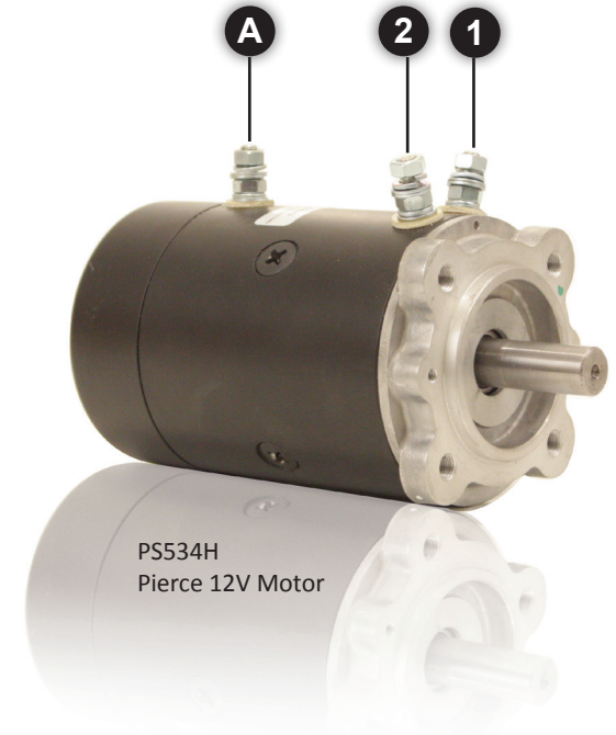
PS534H Pierce 12V Motor

Use the Pierce PS534H or PS534CH Motor on the PS528C round solenoid assembly.