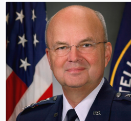
General Hayden Former NSA and CIA Director