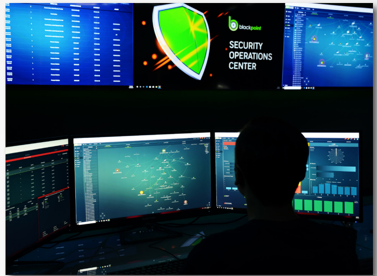
Blackpoint's 24/7 Security Operations Center (SOC)