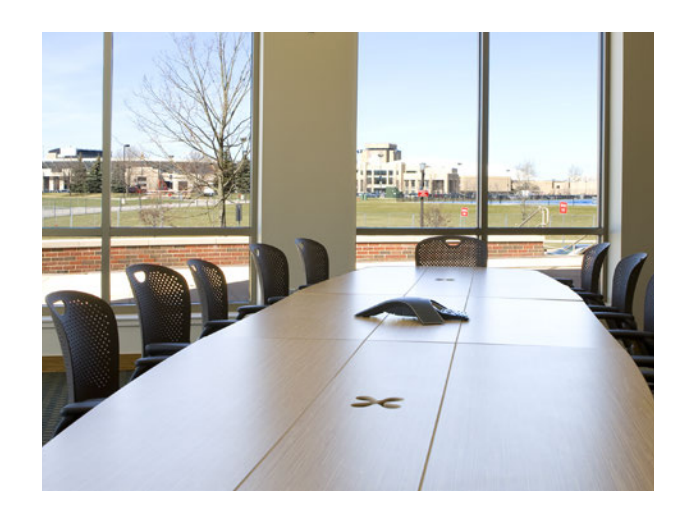
A formal conference room with an inspiring view of the Notre Dame campus retains the flexibility of mobile Intersect tables and Caper seating while conveying the ambience of a corporate boardroom.