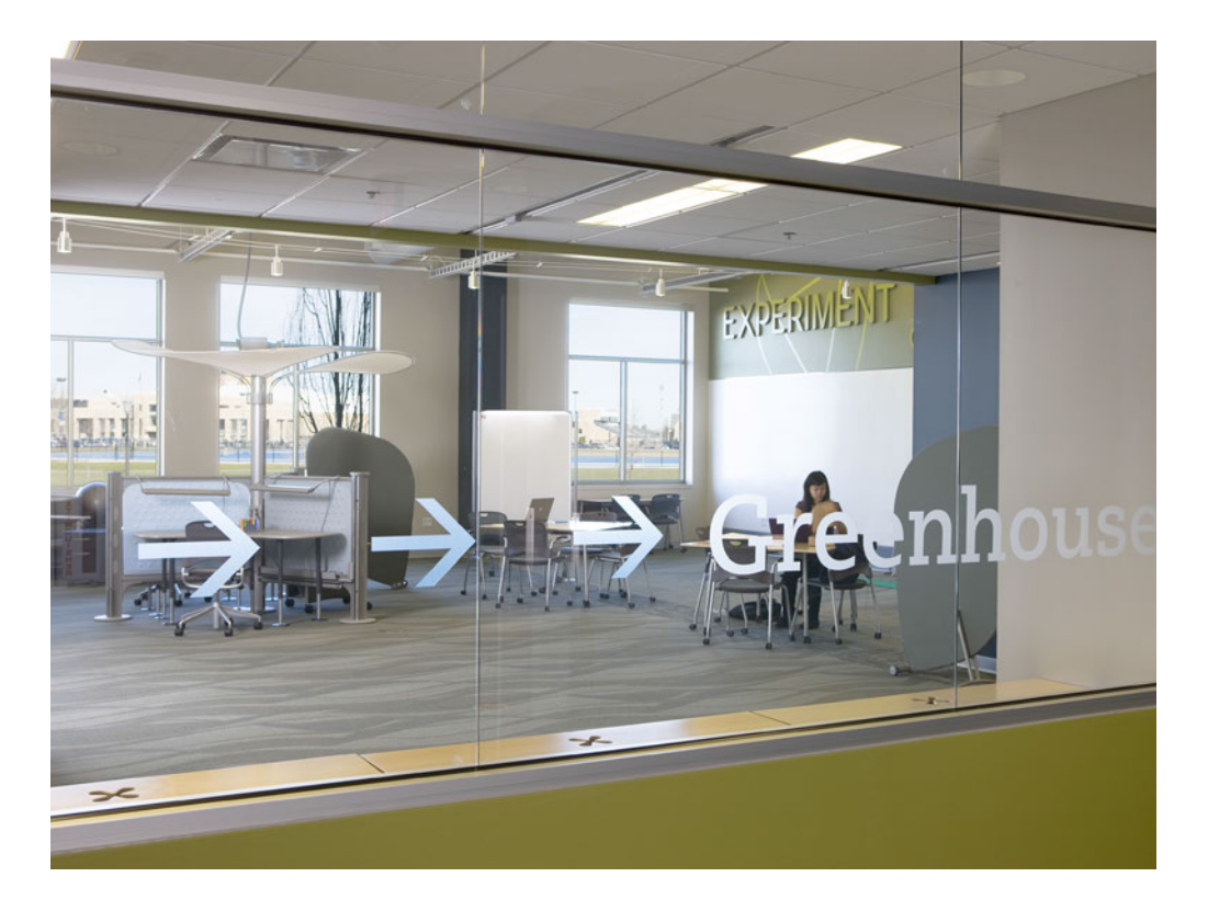
The Greenhouse is meant to inspire "the happenstance of creation," so windows are large, overlooking the Notre Dame campus outside and the corridor inside, and permanent walls are few.