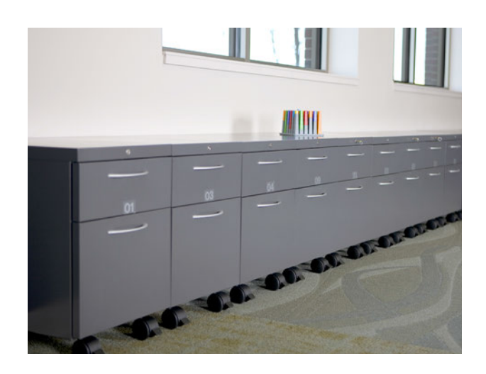
Clients working in the Greenhouse are assigned a mobile Meridian pedestal file. They grab their mobile file, choose the space they need that day—and get to work.

With large windows overlooking the Notre Dame campus, the Greenhouse is the most mobile, open, and collaborative space in the facility, and it is designed to nurture the youngest, most tender businesses and to provide common space where clients and others can mingle and exchange ideas.