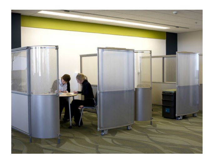
My Studio Environments™ with Intersect tables and Caper chairs create a semi-private meeting space. The workstation's translucent cladding doesn't block light, yet allows users to see whether the space is occupied.

As tomorrow's businesses take up residence at Notre Dame's Innovation Park, their new space will be as energetic and progressive as the ideas they bring.