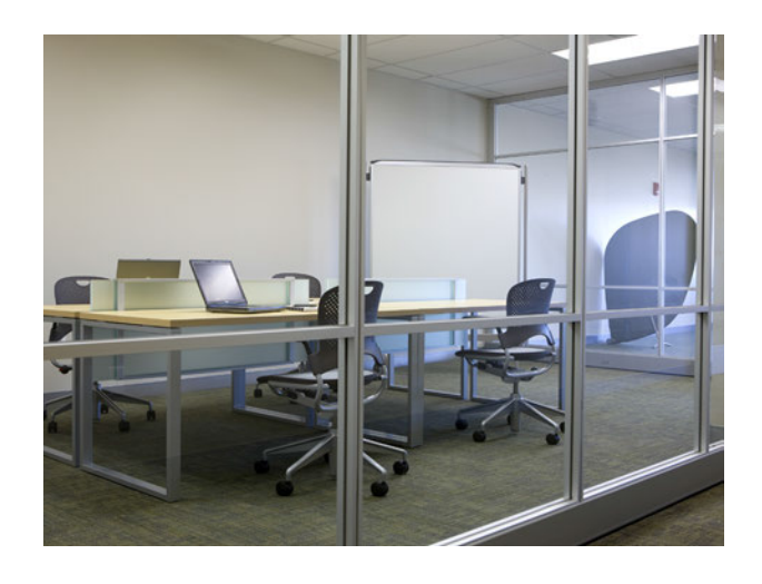
A small breakout room beside the Greenhouse is light and mobile with elements from the Intersect® Portfolio and Caper® chairs.

So the entire building is designed for flexibility. Permanent walls are few and only surround the fixed elements of the building—the labs, the service areas, a conference room on each floor, the administration area, and the café. The environment within the building is dynamic yet sophisticated with curving surfaces, glass, color, and collaborative areas everywhere. Whiteboards and projection equipment are tucked away in corridors; even the walls have writable surfaces.