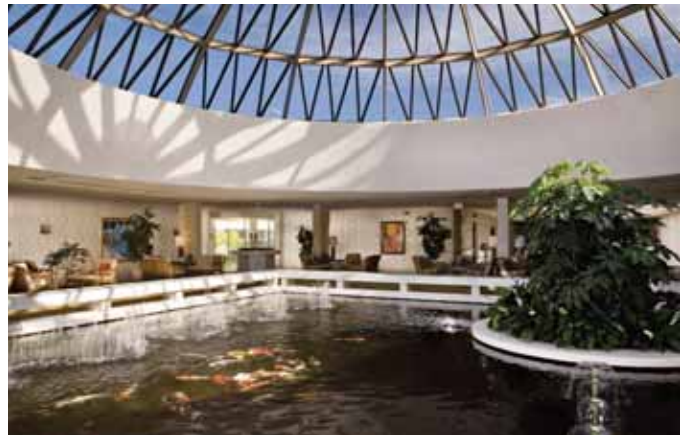
Main hospital lobby with koi pond.