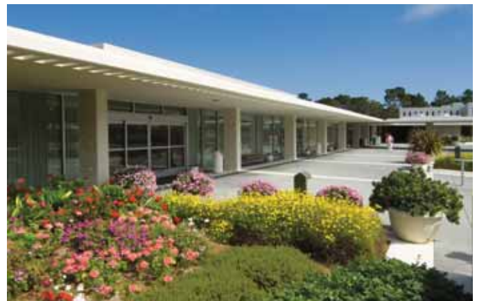
Community Hospital of the Monterey Peninsula main entrance.

Nestled among the Monterey pines in the heart of California, this 250-bed facility was designed by renowned architect Edward Durrell Stone in the early 1960s. With low, horizontal lines and 8-foot overhangs, a 40-foot koi pond, fountains, skylights, large windows, and patient balconies, the hospital creates the kind of natural healing environment that the science would come to support only decades later.