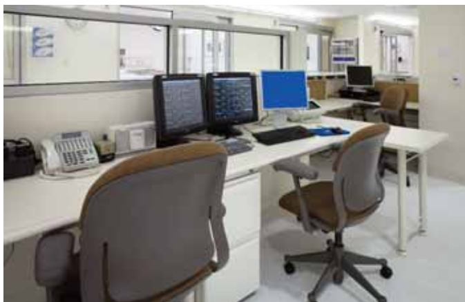
Ethospace nurses' station with Equa chairs.

Indeed, the Community Hospital of the Monterey Peninsula has standardized on some of Herman Miller's earliest systems and healthcare furniture: Action Office® system, along with an assortment of clinical product, such as Ethospace® Nurses' Stations, the Co/Struc® system, a variety of carts, and Equa® chairs. The hospital has maintained these standards for over 40 years, and some of the original product is still in use.