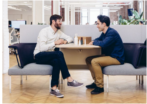
In a casual Cove Setting, agents and supervisors confer without disrupting the work of other team members.

Agents rely on each other, as well as their supervisors, for ideas and guidance that will enable them to respond quickly and effectively to customer questions and demands. Having a socially supportive environment that promotes knowledge sharing through collaboration with colleagues and supervisors and provides appropriate settings for formal and informal training can have a significant impact on both agent and customer satisfaction.