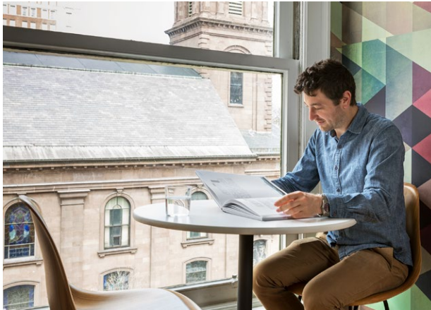
Quiet Haven Settings give agents places to retreat and unwind during breaks.