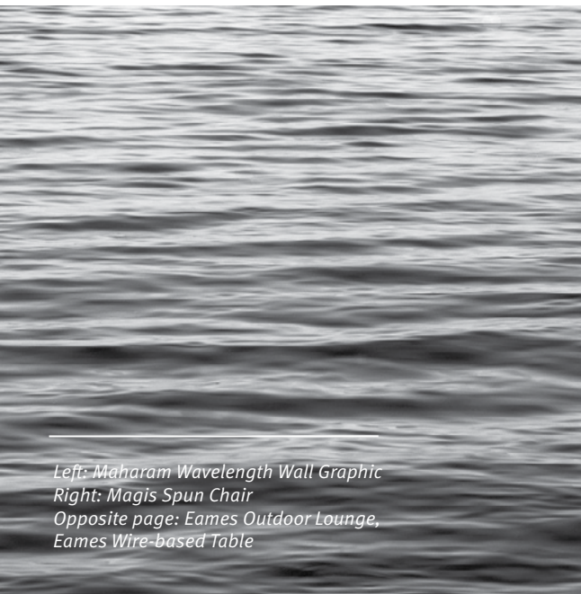
Left: Maharam Wavelength Wall Graphic Right: Magis Spun Chair Opposite page: Eames Outdoor Lounge, Eames Wire-based Table

The indoor/outdoor garden is a growing workplace trend. Forward-thinking companies have learned that building more connective spaces is key to increasing collaboration and innovation. People thrive when provided access to nature and flexibility in their work environment. SOM's Carlos Madrid III shares his favorite complements to a modern workplace garden: the new alternative workspace.