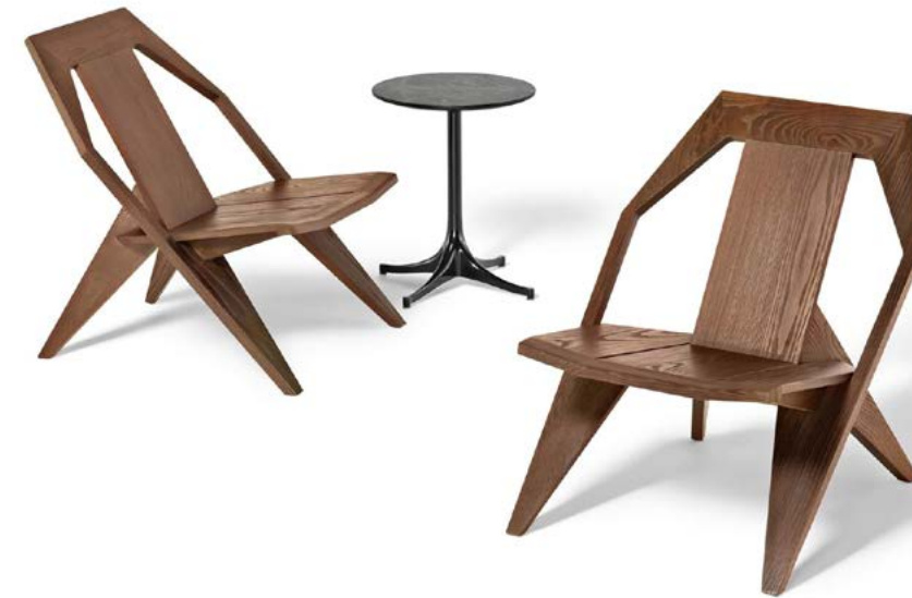
Opposite page: Hay Palissade Above: Magis Air Tables and Chairs Below: Mattiazzi Medici Lounge Chairs, Eames Table with Black Marble Top