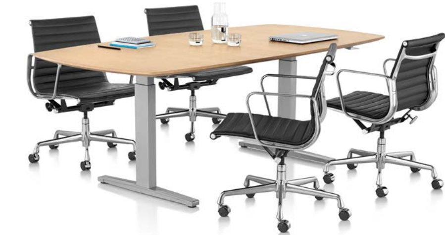
Naughtone Portion Sofa, Hay Raw Rug, Maharam Compartment Pillow, Softline AS Drum Tables, Herman Miller Renew Height Adjustable Table and Herman Miller Eames Aluminum Group Chairs