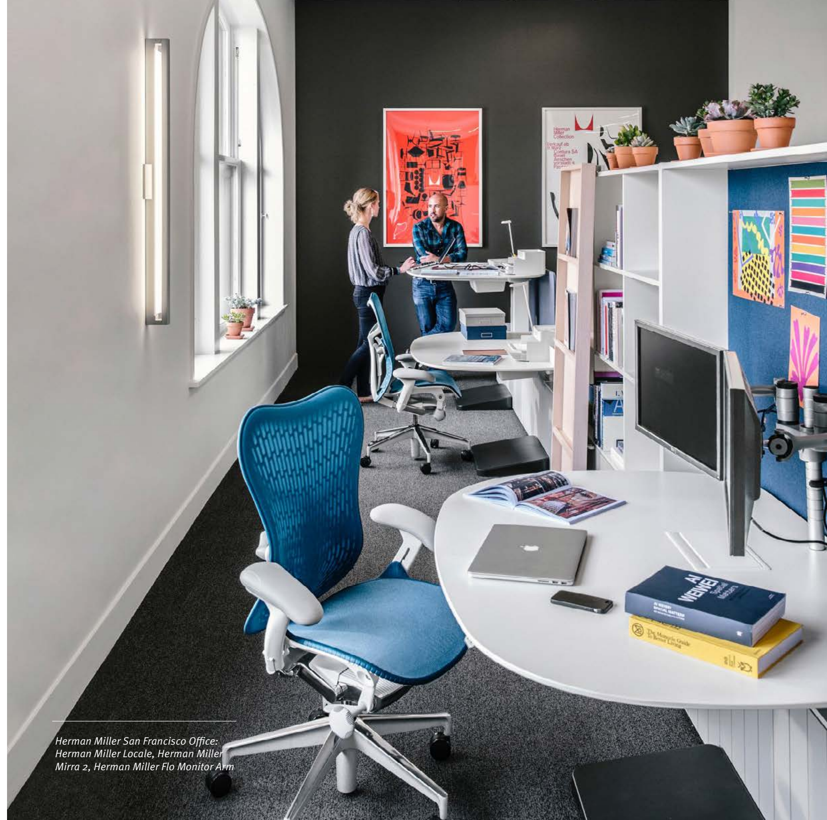
Herman Miller San Francisco Office: Herman Miller Locale, Herman Miller Mirra 2, Herman Miller Flo Monitor Arm