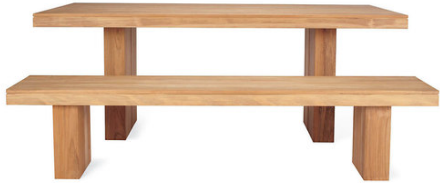
Opposite page: naughtone Always Chair, Trace Table. Clockwise from the top: Eames Molded Plywood Screen, Maharam/Paul Smith Assembled Check Pillow, Maharam/ Hella Jongerius Cork & Felt Rug, Pablo Uma Light, Tacchini Spin Poufs, DWR Kayu Dining Table and Bench

Employee engagement and collaboration flourishes in flexible spaces, creating a need for a hackable work environment. Hackable spaces offer a versatile set of furnishings that allow end users to effortlessly reconfigure their space based on their moment-to-moment needs.