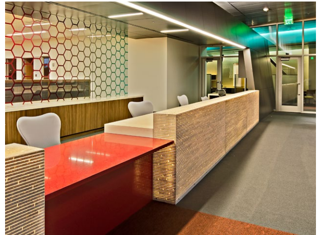
Work chairs are either Mirra® (shown here at the Student Affairs reception desk) or Aeron®, depending on employee preference.