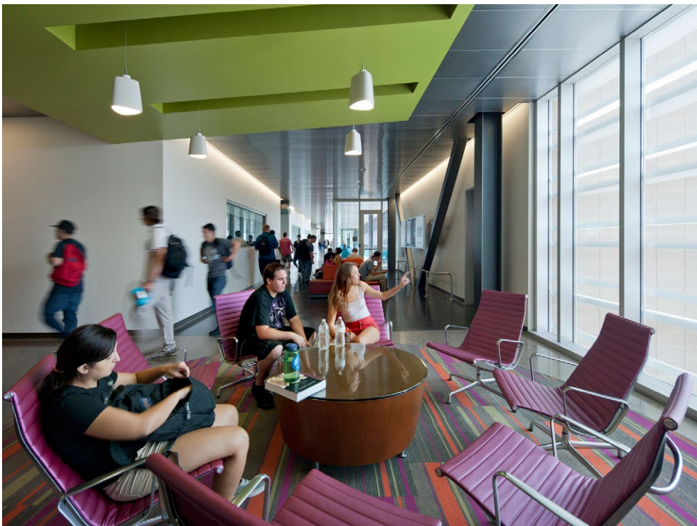
A circle of Eames Aluminum Group Chairs turns a corridor into a collabway.