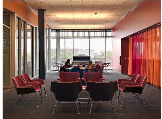
The sweeping curves of Swoop Lounge Furniture make it easy for students to get comfortable whether they're studying alone or working together.