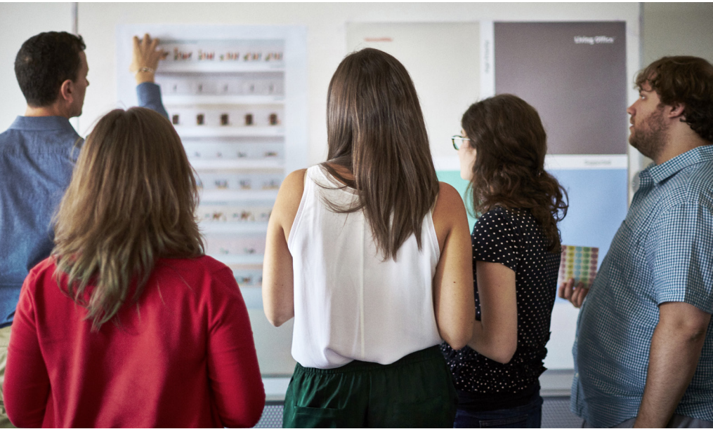
Living Office specialists led focus groups, including architects from Studio Tractor, through the Living Office Discovery Process to help the design team plan an office that would support people's activities, so people could work together—and alone—more efficiently.

To begin this journey, Herman Miller guided Harry's through the Living Office Discovery Process SM , which helps companies identify their purpose, business drivers, character, and activities. This allows an organization and its design partners to prioritize the settings that will best support the needs of people and the business, and to create a workplace with the right mix of these spaces.