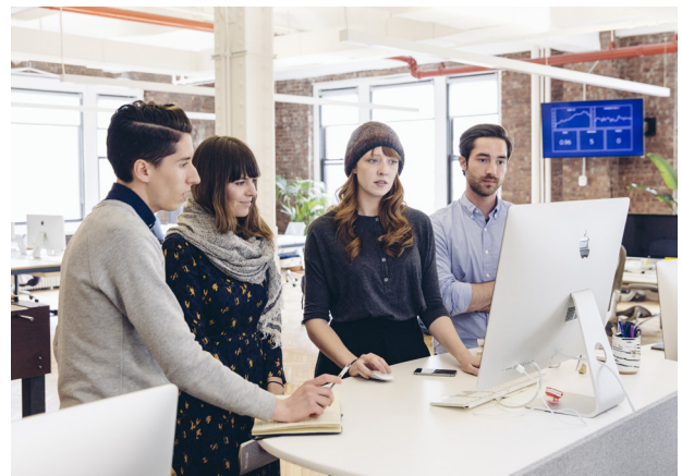
Curved work surfaces invite people to gather for impromptu discussions.

This improvement in employee morale is substantiated by the results of Harry's Leesman® Survey, which measures workplace effectiveness and employees' satisfaction with it. While Harry's previous accommodations garnered a mediocre 48.4 out of 100, its new headquarters received a 71.9—nearly twelve points higher than the Leesman Global Benchmark of 60.1.