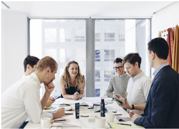
The design for the new space would harness the vibrancy of the old office, but also allow people to do their best work.