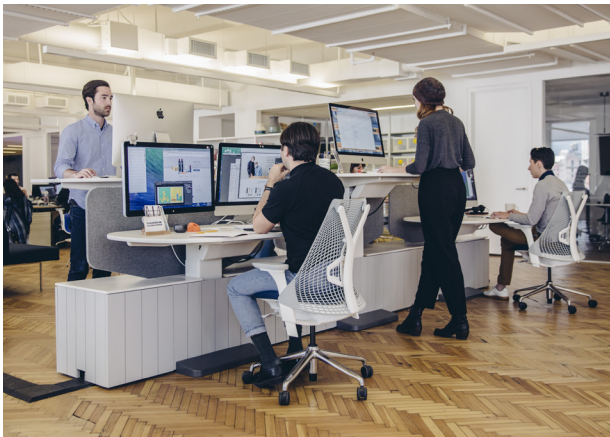
In a Hive Setting outfitted with height-adjustable Locale desks, people make healthy transitions between sitting and standing throughout the day.

With its new workplace, Harry's is fulfilling more than just their business needs; they're also fulfilling people's fundamental needs, such as security and autonomy. Take security, for example. When an office allows people to get their work done in a comfortable, intuitive way, people can worry less and focus more. Newlin can already see this happening in the new office. "You can walk into this space and know exactly what you need to do during the day, where you're supposed to work, and where you can store things," says Newlin.