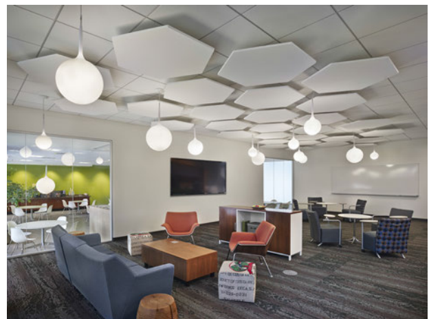
Mars Drinks' Living Office provides plenty of opportunities for people to connect and collaborate.