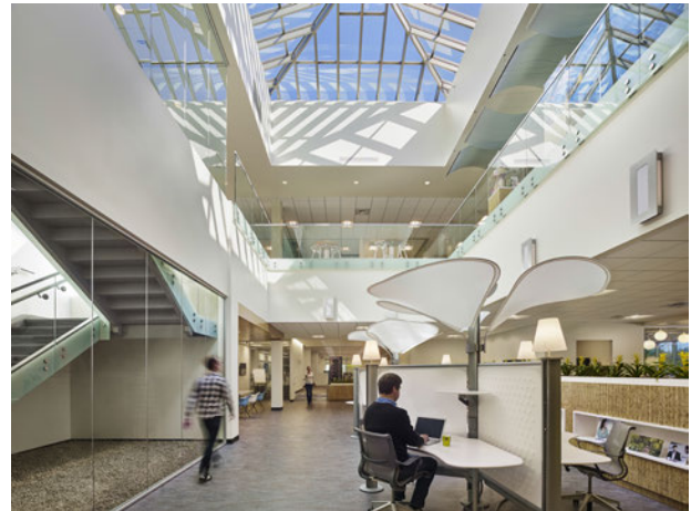
When Mars Drinks' associates need a place for individual, heads-down work, the new environment offers a variety of options.