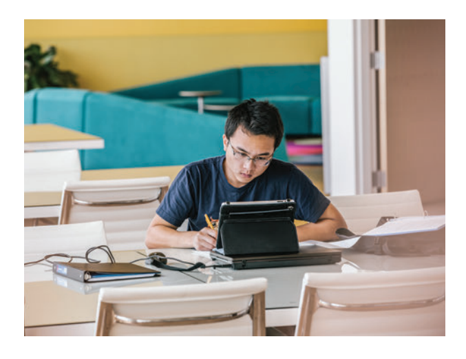
Students frequent the library because it offers all of the resources they need to work and study, including seamless connection to power and data.

The facility also serves as a paragon of environmentally sensitive design. The LEED-certified building features rooftop gardens, floor-to-ceiling expanses of glass, an innovative chilled-beam air-conditioning system, and ceilings soundproofed in part with fabric from recycled blue jeans.