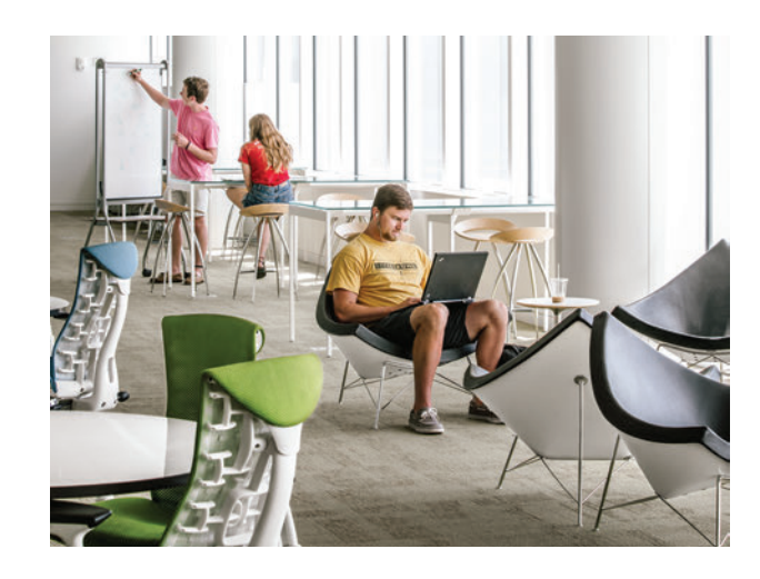
Casual open settings encourage spontaneous interactions where students can learn from one another.

"Perhaps the best quantifiable feedback is one of the things we did when we opened," says Hiscoe. "Students could take a photograph, put it on Instagram, and tag it as #myhuntlibrary. Our expectations were if we got 150 photographs, we would be really happy. We ended up getting over 4,000. There is a real pride in the building—a real sense that this is a fun place to be and a place that encourages creativity and exploration."