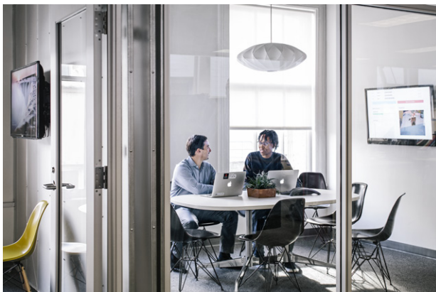
A bubble lamp designed by George Nelson, former Herman Miller Director of Design, floats above an Eames Table and Shell Chairs in Piston's meeting space.

Another difference is the lack of a formal conference room. This was eliminated in favor of a large, comfortable lounge area. At any time of day, engineers, salespeople, marketers, or other members of Piston's 50-person team can be found using that space for informal meetings or just to socialize. "There's a marvelous cross-pollination of ideas when you have engineers