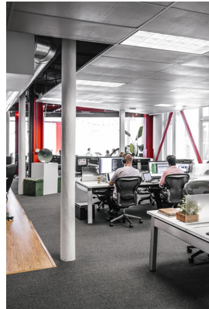
Inside Piston's headquarters in San Francisco's Union Square District, workspaces are arranged in an open layout that brings together various teams—engineering, marketing, sales, and more—to facilitate communication and interaction.