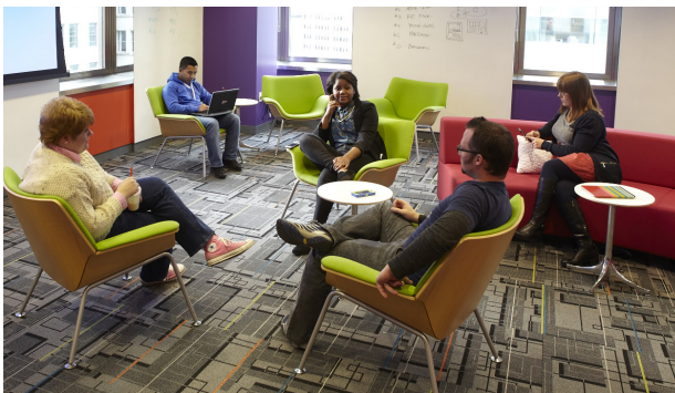
Swoop™ Lounge Furniture helps team members connect in comfort in a Quicken Loans collaboration area.

The third aspect of ergonomics is completed by Flo Monitor Supports, which use patented geometric spring technology to permit precision adjustment of computer screens with minimal effort.