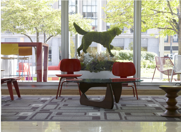
The lobby of one Quicken Loans high-rise includes classics like Eames® Molded Plywood Chairs, Eames Walnut Stools, and a Noguchi® Table.

But around the next corner, you're likely to spot something so quirky it could only be Quicken Loans. How about blowing off some steam with a slushy and some popcorn? Or grabbing a chew from a seven-foot gumball machine? Or perhaps cruising around the office in an adult-size Big Wheel? One high-rise occupied by Quicken Loans even boasts an indoor basketball court with a spectacular view overlooking downtown.