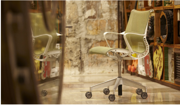
Versatile Setu® Chairs are used in various applications that require short-term seating.