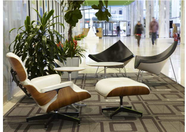
Quicken Loans welcomes guests with distinctive lobby seating like this Eames Lounge Chair and Ottoman and Nelson™ Coconut Lounge Chair.