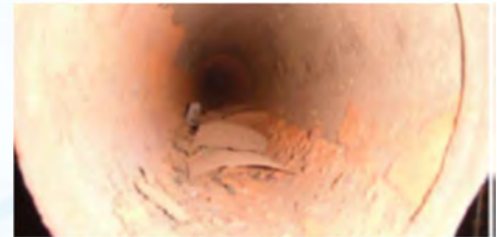
Iron Oxide Deposits on Bottom of Main

Project Type: Large Warehouse Facility Location: Florida, USA Sprinkler Systems: 1.19 million sq. ft. of gross leasable space, 36 wet pipe fire sprinkler systems Nitrogen Introduced: December, 2012