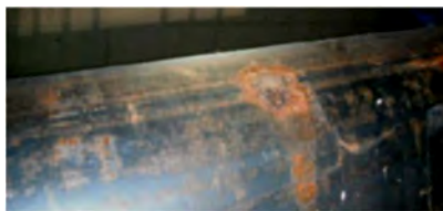
Exterior Leak on 6" Main