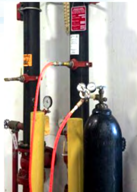
Pressurized Cylinders Provide Nitrogen Gas

Since the initial inerting of the 36 wet pipe systems the mall has only experienced one leak. The fire sprinkler contractor referred to WPNI as the 'miracle cure' that has completely resolved the mall's corrosion issues.