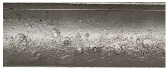
Corrosion on Bottom of Branch Line