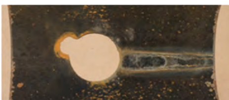
Air Trapped at Top of Main