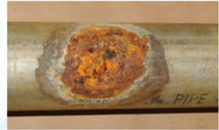
Exterior of Branch Line Leak