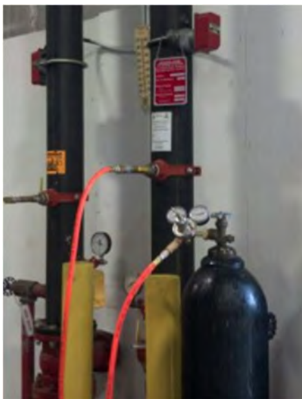
Pressurized Cylinders Provide Nitrogen Gas through injection ports at risers