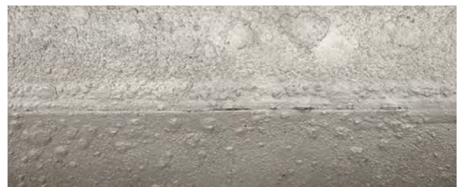
Corrosion on Bottom of Main