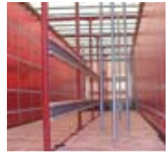
Custom load restraint racks on interior