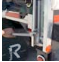
Alum. rear corner w/ curtain Quick Release