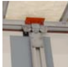
HydroMatic Rolling Pillar Upper Locator