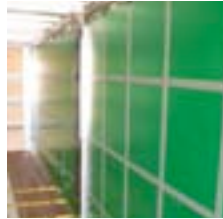
Full 102" inside width & matrix curtain reinf.