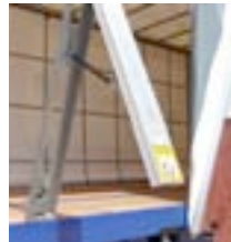
HydroMatic Rolling Pillar Roof Supports