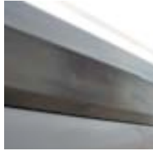
Tight pelmet seal against top of curtains