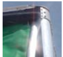
Aluminum radius front corner posts