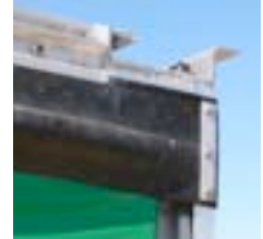
Rear header upper rain gutter