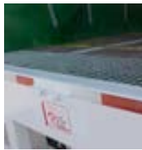
Rear threshold plate for forklift impact