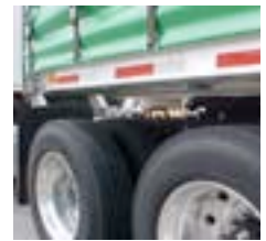
Aluminum TJ side rail with 7" upper coupler