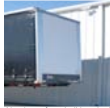
Aluminum front bulkhead w/ FRP