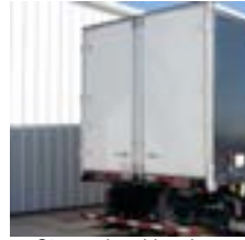
Stress absorbing door hinge locations