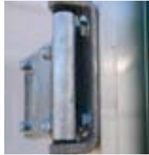
Bolt-on aluminum door hinge butts