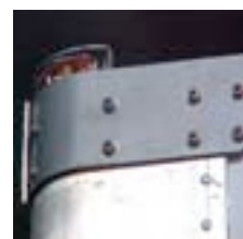
Rounded corners with upper light protectors