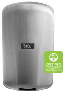
TA-SB Brushed Stainless Steel

MODELS: TA - ABS SB -VOLTAGE (See Chart)