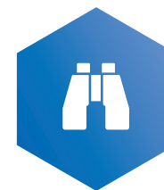
Code and Zoning Assessment