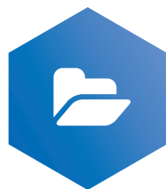
Municipal Records Technical Evaluation