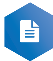
Document and Floor Plan Review