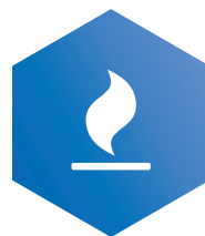
Fire, Life Safety, and Accessibility On-Site Survey