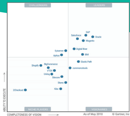
commercetools Named a Visionary in Digital Commerce