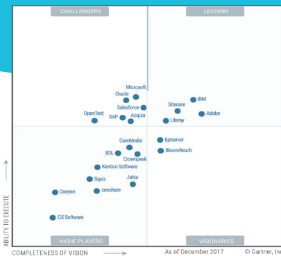
Bloomreach Named a Visionary in Digital Experience Platforms

Two visionary solutions are freeing brands to create more relevant, individualized customer experiences.