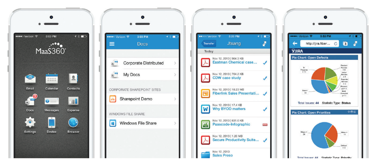
Figure 1: Examples of the MaaS360 container, data repositories, documents, and an intranet site on mobile devices