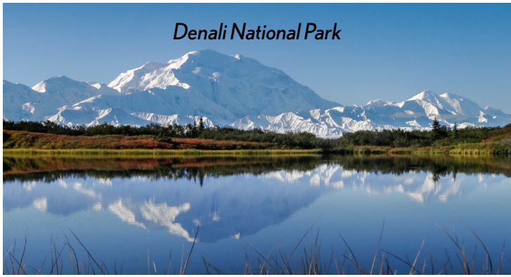
Denali National Park