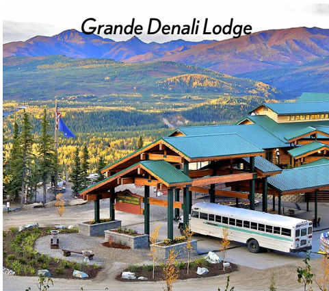
Grande Denali Lodge