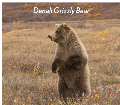
Denali Grizzly Bear