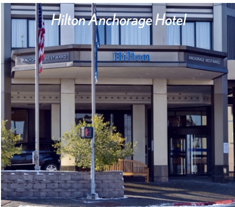
Hilton Anchorage Hotel