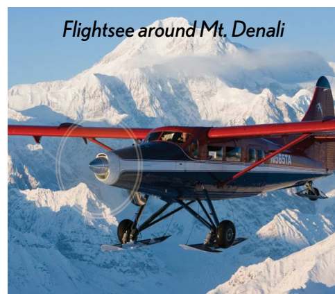
Flightsee around Mt. Denali