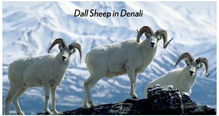
Dall Sheep in Denali

Denali National Park should be at the top of every adventurer's bucket list. This astounding destination extends over six million acres of preserved wilderness and is home to majestic Mount McKinley (now officially known as Mt. Denali or 'the Great One' in the Denaina Athabaskan language), the highest peak in North America. The pristine wilderness of Alaska is, perhaps, the last bastion of thriving populations of North American wildlife. With breathtaking scenery, unique wildlife sightings and an opportunity to immerse yourself in the pure, untamed wilderness of Alaska, we invite you to join the women of Olivia on a journey to Denali National Park.