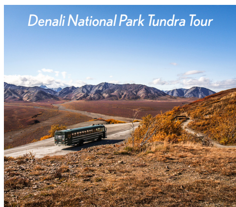
Denali National Park Tundra Tour

You will have a section of the restaurant and great, sweeping views of the park and Alaska Range as you dine in the company of Olivia women, your Olivia escorts and guides! Included Meals: B/L/D