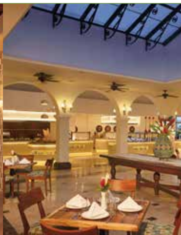
World Café Buffet continental cuisine