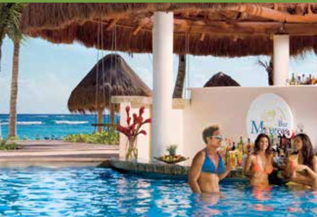
Manatee Swim-up bar