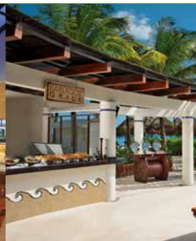
Barefoot Grill Grilled favorites