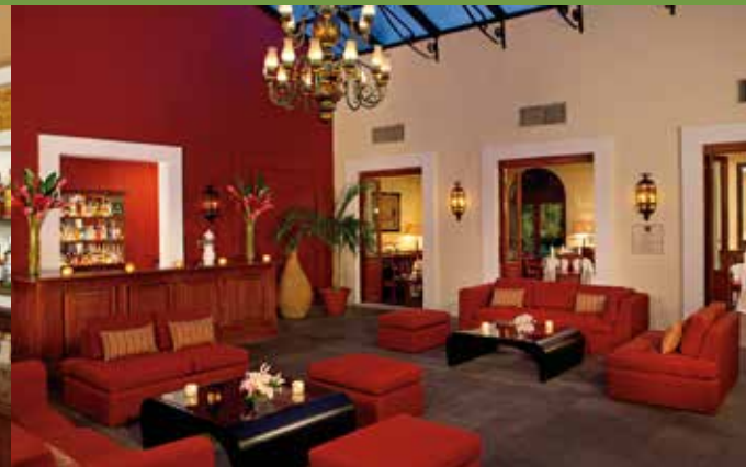
The Lounge Evening bar

Sip on unlimited international and domestic top-shelf spirits, beer, wine, juices, and soft drinks in 7 bars and lounges