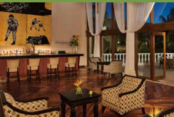
Rendezvous Lobby bar

Sip on unlimited international and domestic top-shelf spirits, beer, wine, juices, and soft drinks in 7 bars and lounges