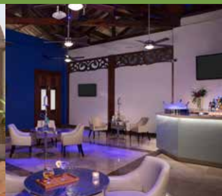
Sky Sports Bar Sports bar