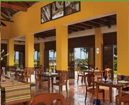
El Patio Delectable Mexican cuisine