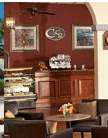
Coco Café Coffee and snacks