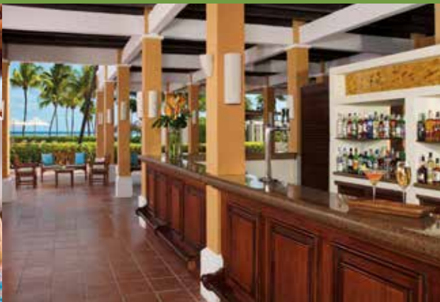
Sugar Reef Beach bar