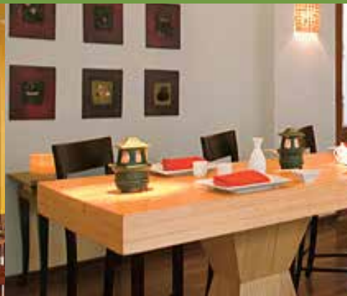
Gohan Sushi and Peruvian tiraditos