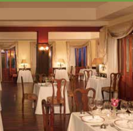
Bordeaux Gourmet French cuisine