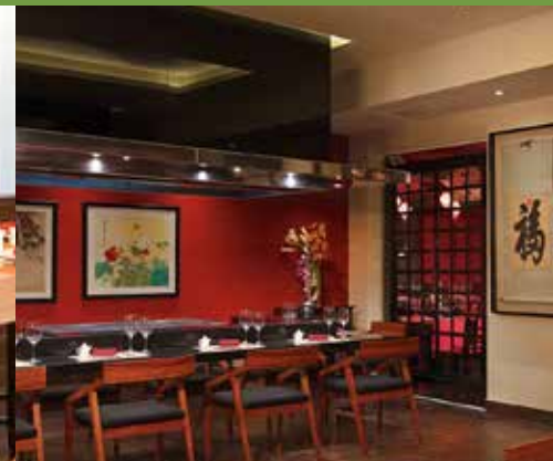
Himitsu Pan-Asian cuisine with two teppanyaki tables