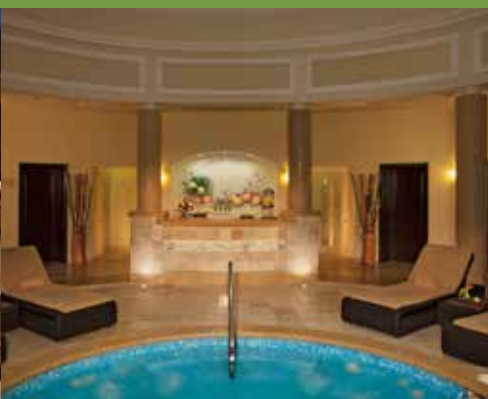
Revive Spa bar