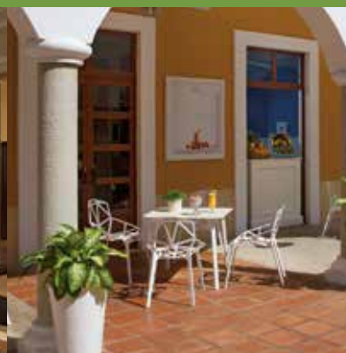
Smoothie Bar Frozen shakes and smoothies