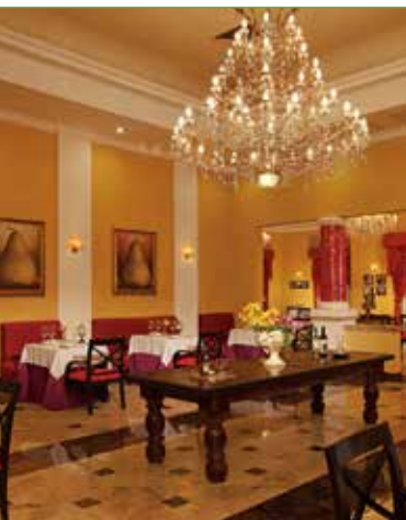
Portofino Traditional Italian