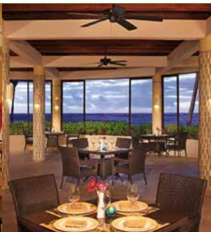
Seaside Grill Steak and grilled specialties