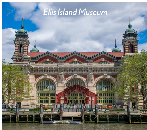
Ellis Island Museum