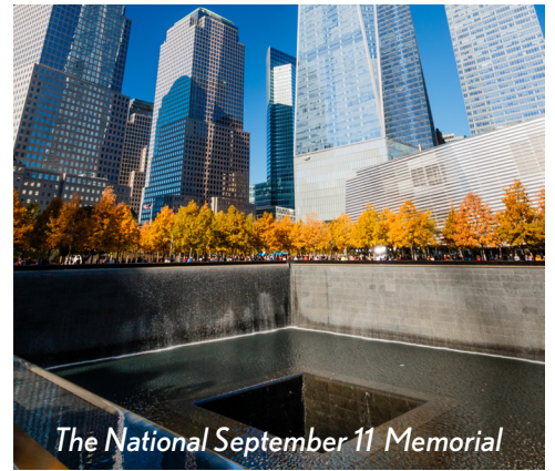
The National September 11 Memorial