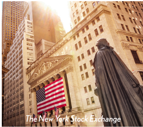
The New York Stock Exchange