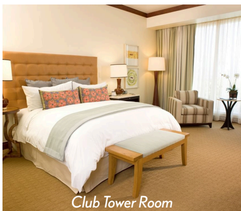
Club Tower Room