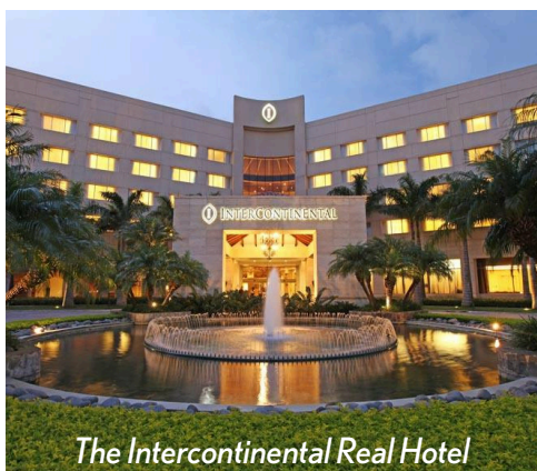
The Intercontinental Real Hotel