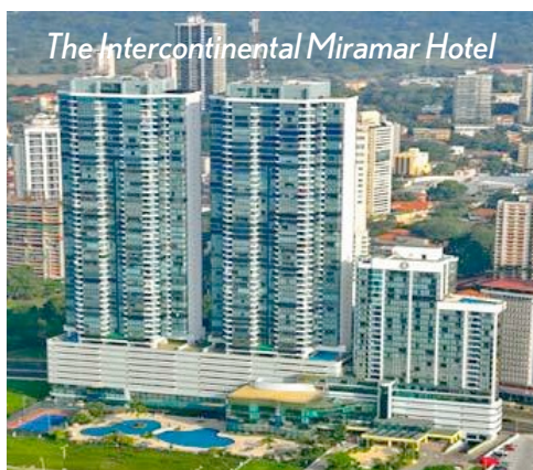
The Intercontinental Miramar Hotel