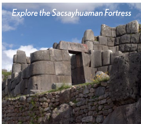
Explore the Sacsayhuaman Fortress

Included Meals: Breakfast, Lunch, Dinner