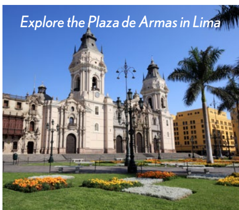
Explore the Plaza de Armas in Lima