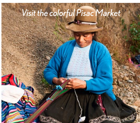
Visit the colorful Pisac Market