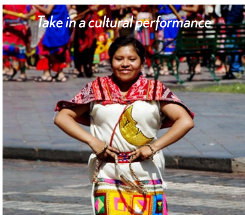
Take in a cultural performance