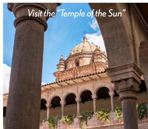
Visit the "Temple of the Sun"