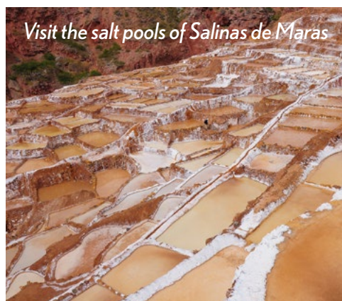
Visit the salt pools of Salinas de Maras