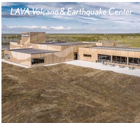
LAVA Volcano & Earthquake Center