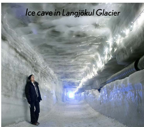
Ice cave in Langjökul Glacier

Tonight, you will be free for exploring and dinner on your own.