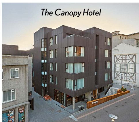
The Canopy Hotel