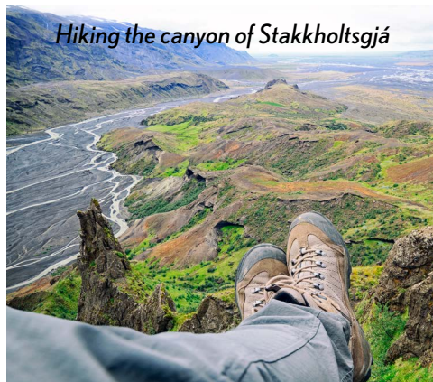
Hiking the canyon of Stakkholtsgjá