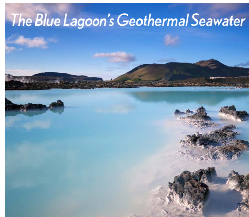
The Blue Lagoon's Geothermal Seawater

The Blue Lagoon's geothermal seawater is known for its positive effects on the skin. The algae have anti-aging properties and the silica strengthens the skin. Combined, they aid in clearing your complexion and having healthy-looking skin.