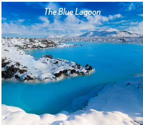
The Blue Lagoon

The geothermal water has a unique composition, featuring three active ingredients: silica, algae and minerals. The blue color, where the Blue Lagoon gets its name, comes from the silica and the way it reflects sunlight. During the summer months you may also see a hint of green in the water. This is the result of the algae, which multiplies quickly when exposed to direct sunlight.