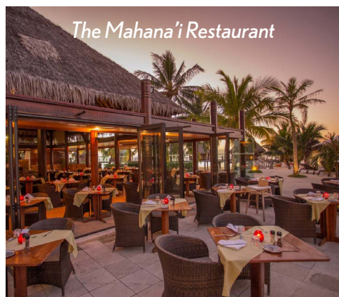
The Mahana'i Restaurant