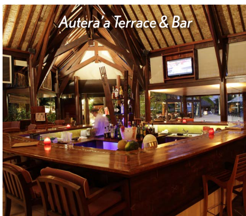
Autera'a Terrace & Bar