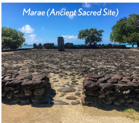
Marae (Ancient Sacred Site)