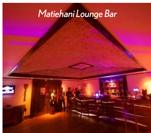
Matiehani Lounge Bar