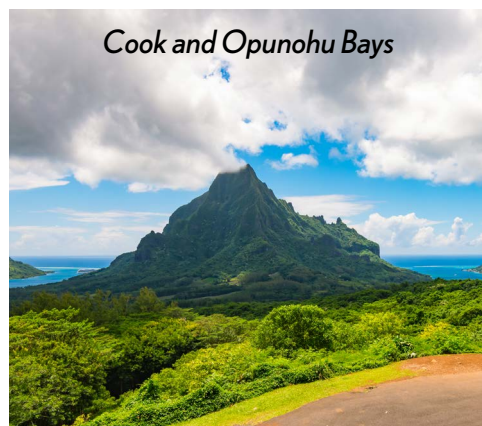
Cook and Opunohu Bays