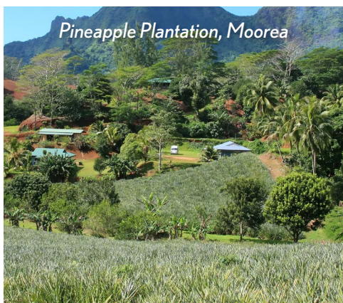
Pineapple Plantation, Moorea