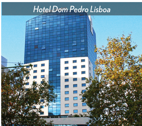
Hotel Dom Pedro Lisboa