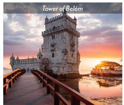
Tower of Belém