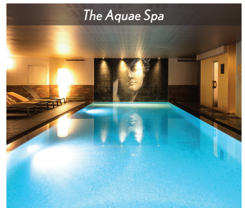
The Aquae Spa