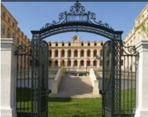
Marseille Intercontinental Hotel Dieu