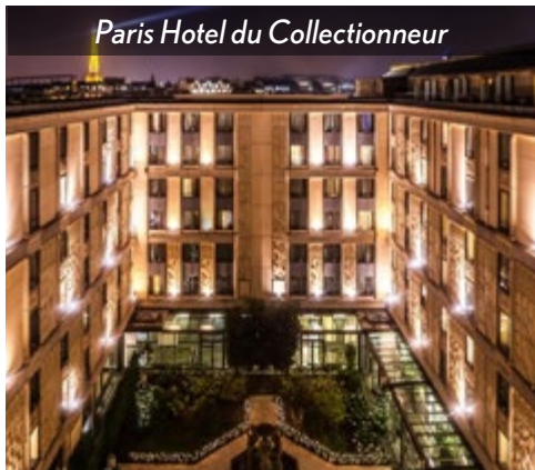
Paris Hotel du Collectionneur