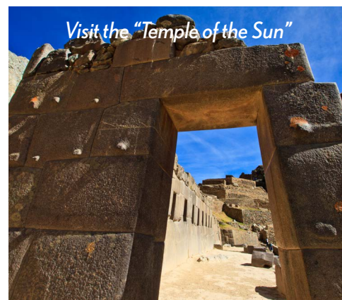
Visit the "Temple of the Sun"