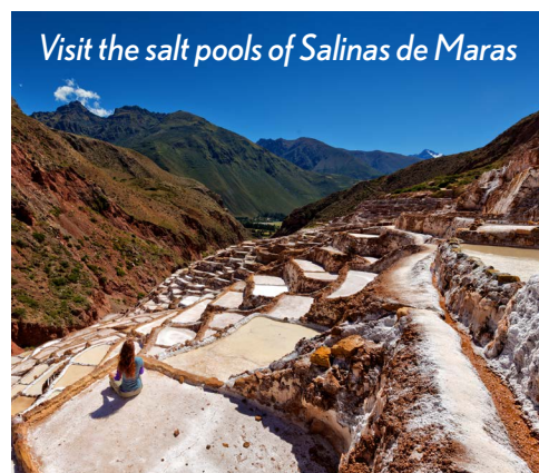
Visit the salt pools of Salinas de Maras