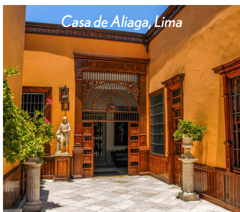
Casa de Aliaga, Lima