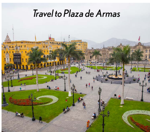
Travel to Plaza de Armas