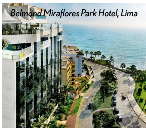
Belmond Miraflores Park Hotel, Lima