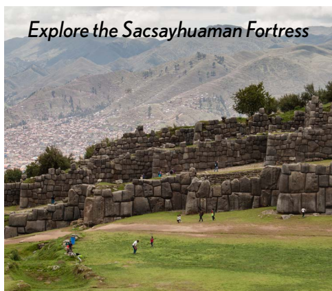
Explore the Sacsayhuaman Fortress

Included Meals: Breakfast, Lunch, Dinner