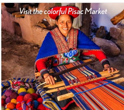
Visit the colorful Pisac Market