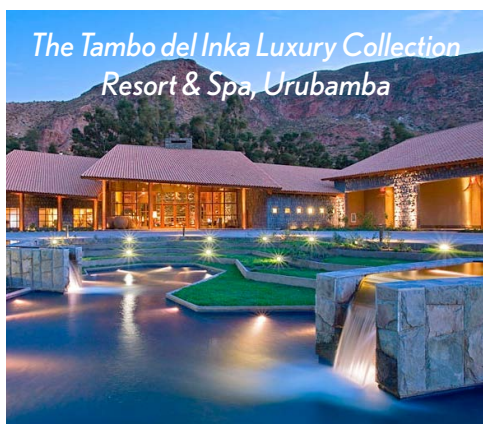
The Tambo del Inka Luxury Collection Resort & Spa, Urubamba