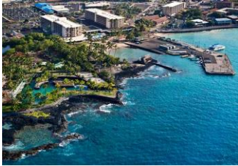
Courtyard by Marriott King Kamehameha's Kona