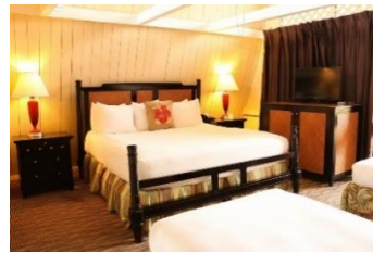
Hotel Moloka'i – Deluxe Garden View