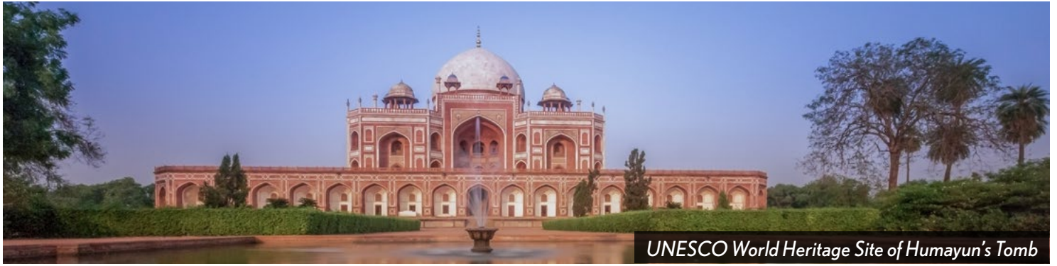
UNESCO World Heritage Site of Humayun's Tomb