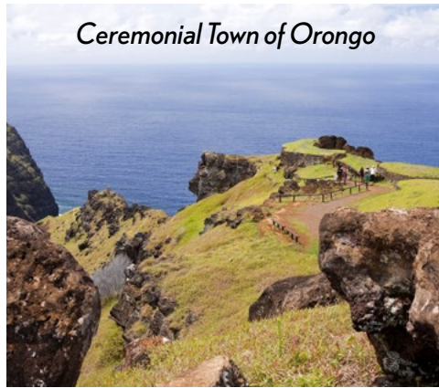
Ceremonial Town of Orongo