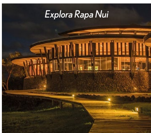
Explora Rapa Nui

In-room amenities include an LCD television, espresso maker, hairdryer, iron/ironing board, blackout drapes, in-room safe, complimentary in-room wifi, iPod docking station, Tempur-Pedic mattress, and premium bedding. Hotel amenities include restaurant and bar/lounge, indoor pool, fitness center, spa services, business center, and wifi in the lobby.