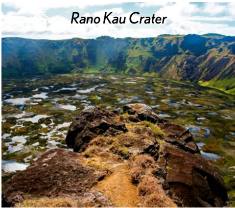
Rano Kau Crater