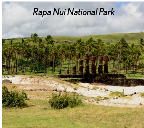
Rapa Nui National Park