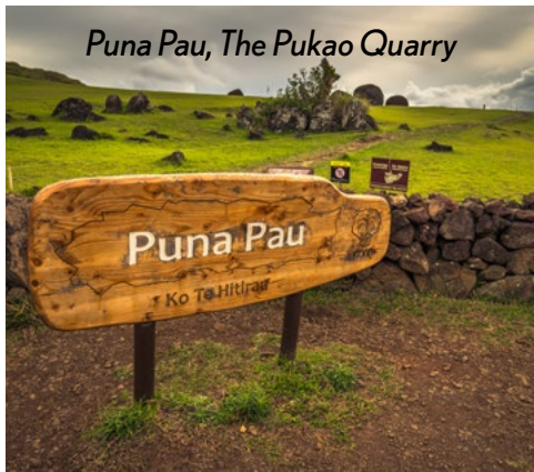
Puna Pau, The Pukao Quarry