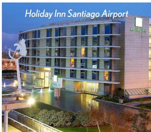
Holiday Inn Santiago Airport