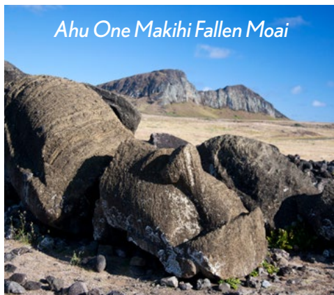
Ahu One Makihi Fallen Moai