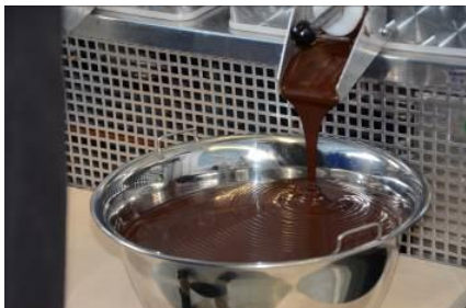
Pour your own chocolate