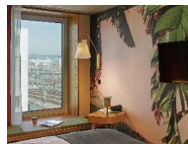
L Superior Room