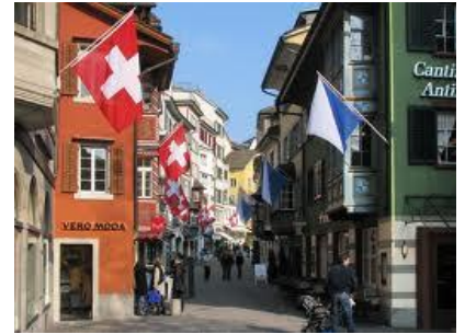
Old Town Zurich, Switzerland