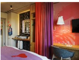
M Standard Room

The 269 sq. ft. L rooms offers a choice of king-size or twin beds. All rooms have city views. Separate bathroom with a rain shower in the center of room is a unique highlight!