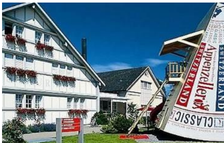
Appenzeller Cheese Factory