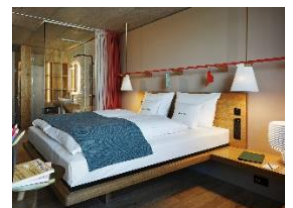
L Superior Room