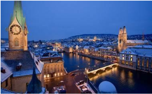
Zurich, Switzerland at night