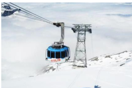
Gondola Ride to Mount Titlis