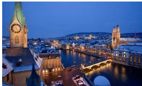
Old Town Zurich at Night