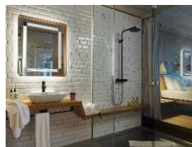
L Superior Room