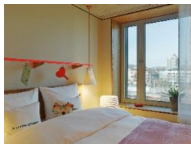
M Standard Room