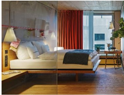
Hotel 25 Zurich, Superior L Room