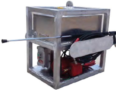
Electric Screen Cleaner with Tank