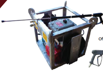
Electric Screen Cleaner, No Tank