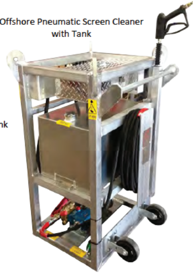
Offshore Pneumatic Screen Cleaner with Tank