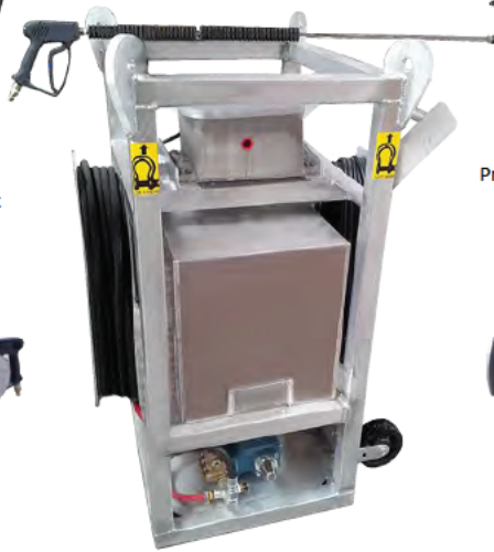
Offshore Electric Screen Cleaner with Tank