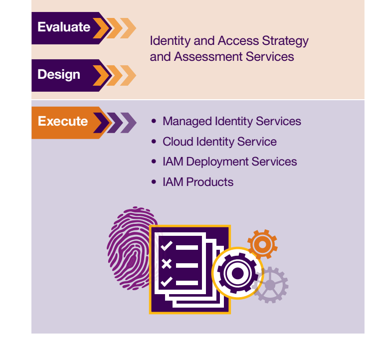
Figure 4: IBM can offer end-to-end solutions to support your IAM needs from evaluation and design of an IAM strategy to its execution