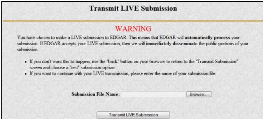
Figure 9-4: Transmit Live Submission Page