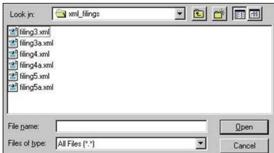
Figure 9-5: Transmit Live Submission File Upload Window

Note: If your XML submission does not appear immediately, change the Files of Type to All Files (*.*) .