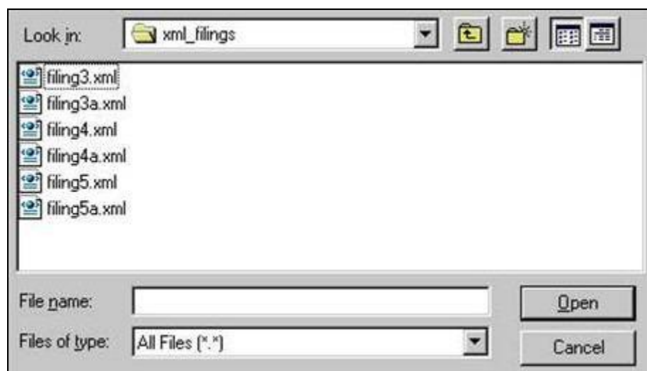
Figure 9-3: Transmit Test Submission File Upload Window

Note: If your XML submission does not appear immediately, change the Files of Type to All Files (*.*)