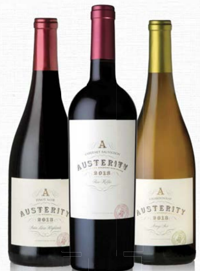
©2017 AUSTERITY WINES, PARLIER, CA