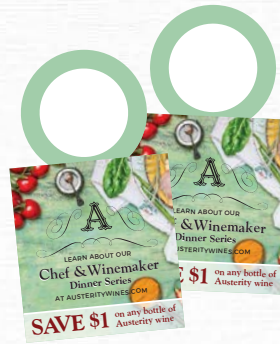
IRC & MIR HANG TAGS