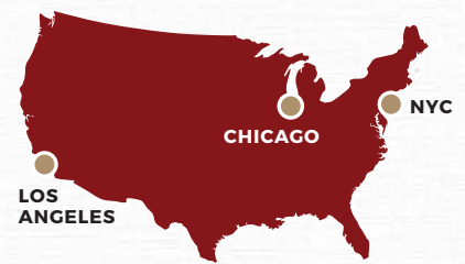
MARCH THROUGH APRIL